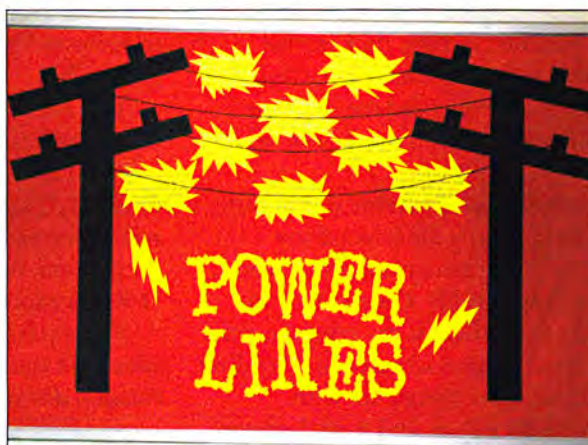
Hobby-turned-ministry: a sampling of the more than 670 bulletin boards created by "The Bulletin Board Lady"